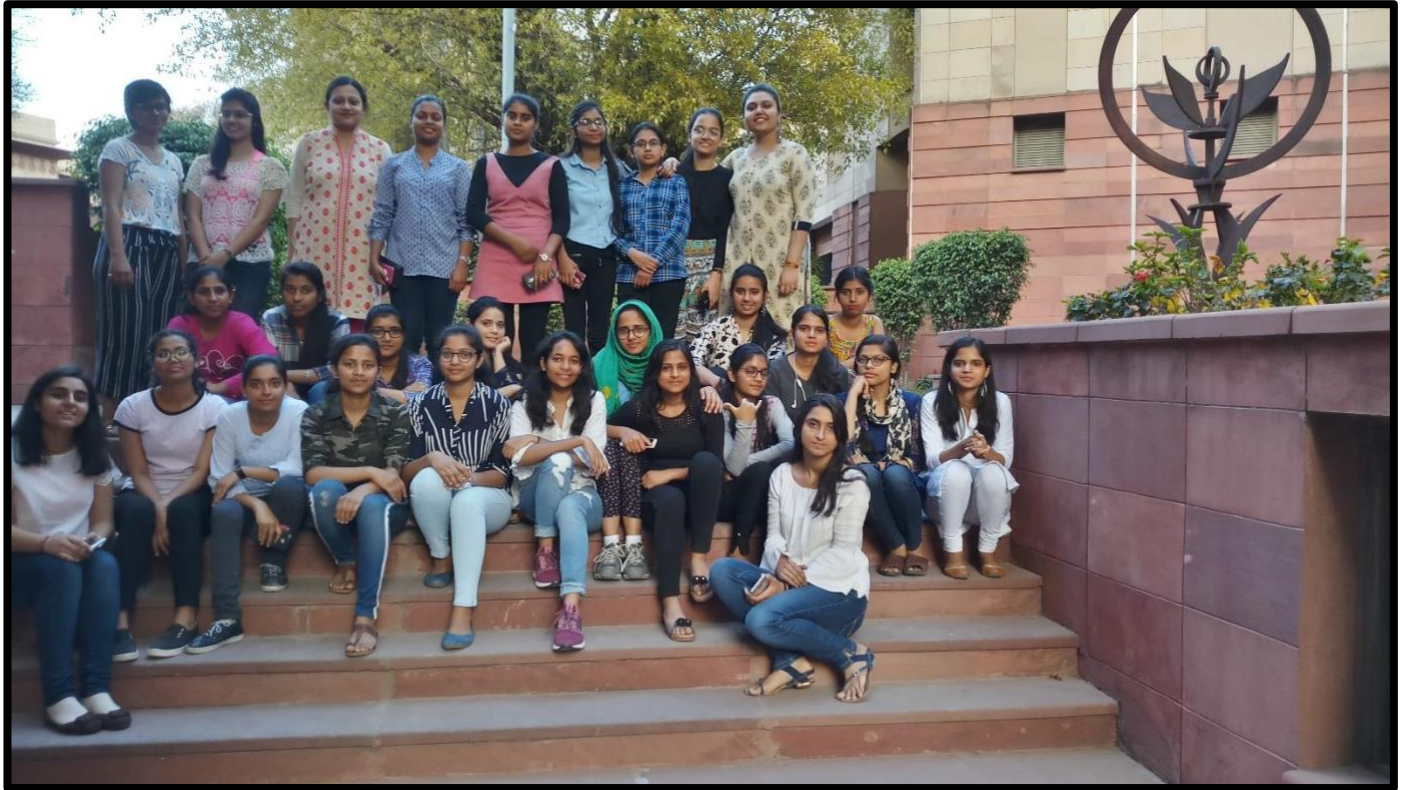
Field trip to the National Gallery of Modern Art