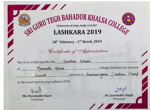
Sri Guru Tech Bahadur Khalsa College