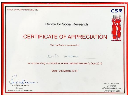
Centre of Social Research