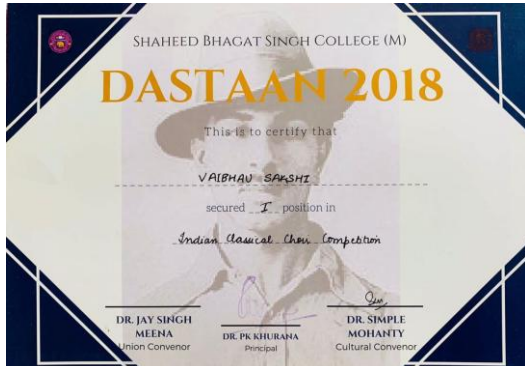
Shaheed Bhagat Singh College