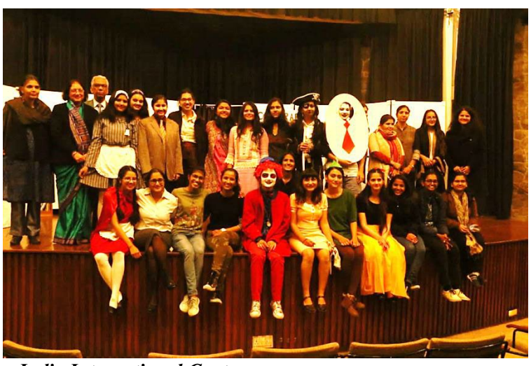
'Light in the Library' Miranda House Team, India International Center