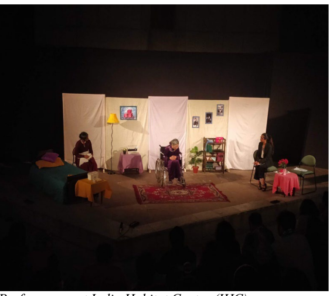
Performance at India Habitat Centre (IHC)