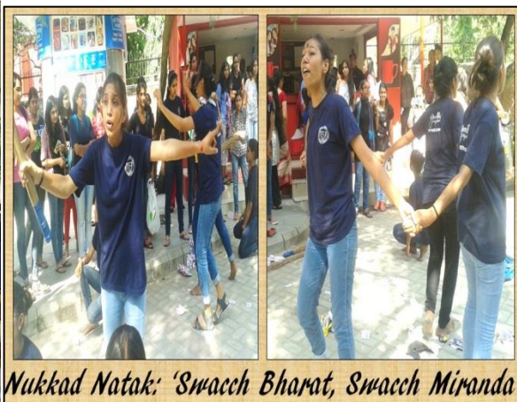
Nukkad Natak: 'Swacch Bharat, Swacch Miranda'