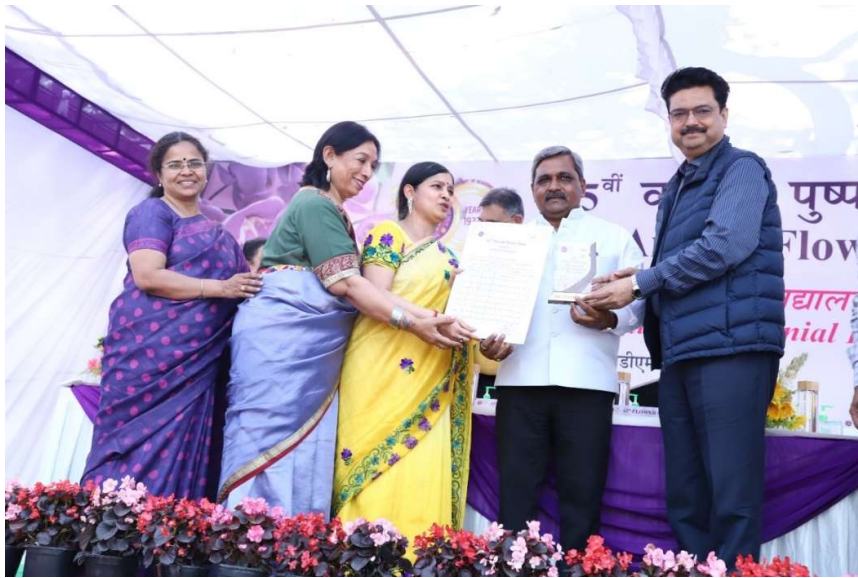
Team Miranda House receiving awards in 65 th Annual Flower Show