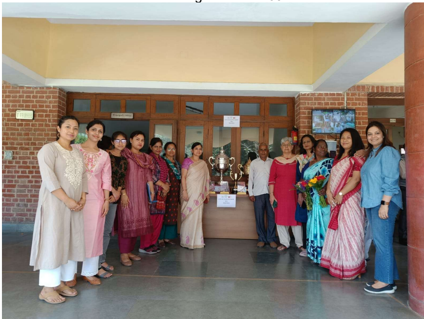
Team Miranda House with all the cups won during the 65 th Annual Flower Show