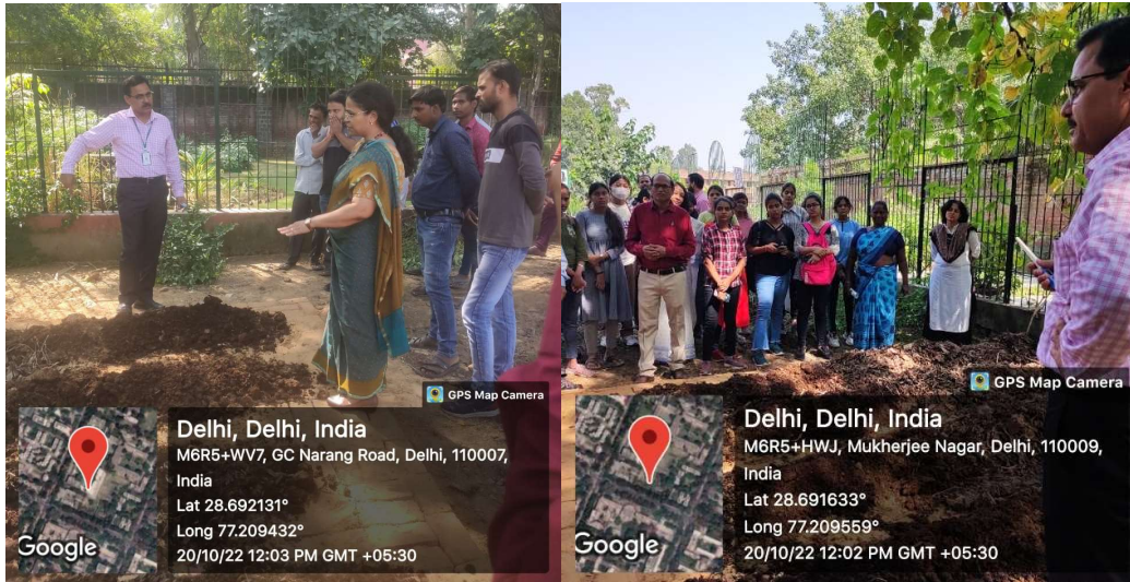
Resource person giving demonstration on Composting Techniques during the Composting Techniques workshop