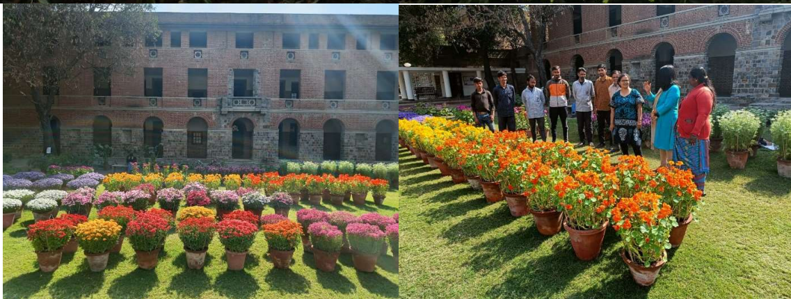
Lustrous college lawn and vibrant flowers for the 65 th Flower Show preparation