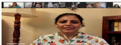
Glimpses of Vigilance Awareness Week