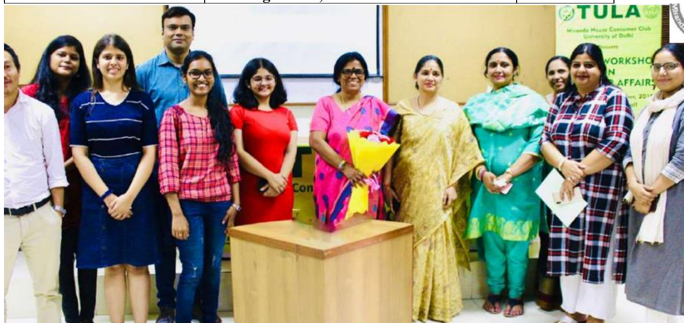
Students and Faculty at the Annual Workshop