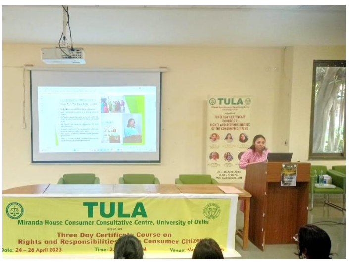
Individual/Group presentation competition