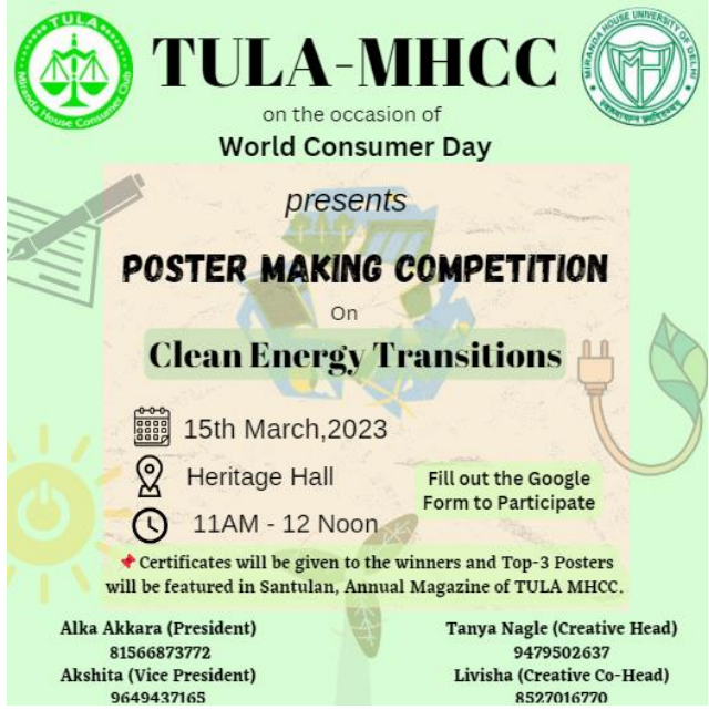
Poster Making Competition 2023