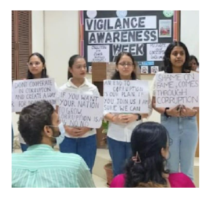
Vigilance Awareness Week 2022