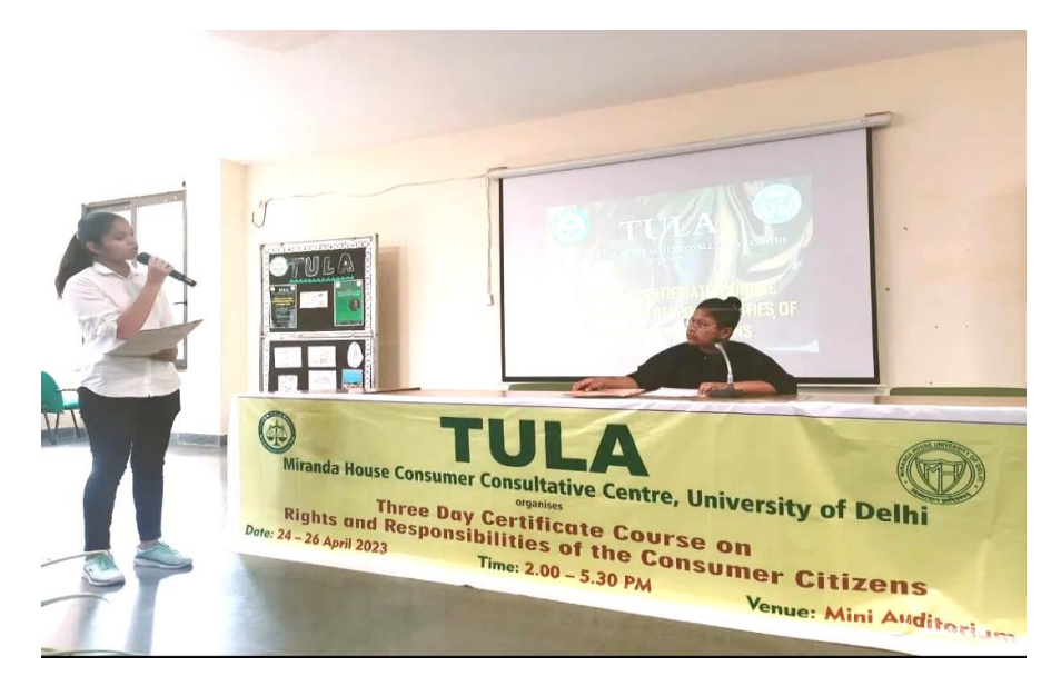
Mock Consumer Court