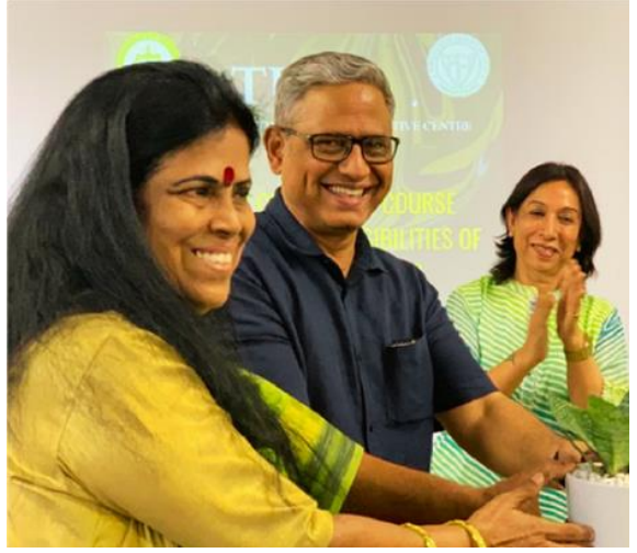
Certificate Course Organised by TULA MHCCC