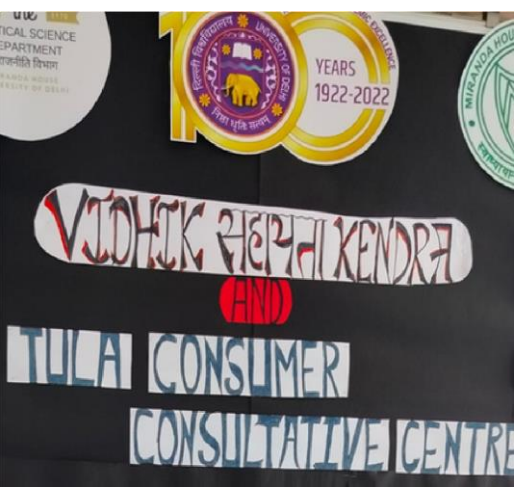
Inauguration of TULA Consumer Consultative Centre 2023