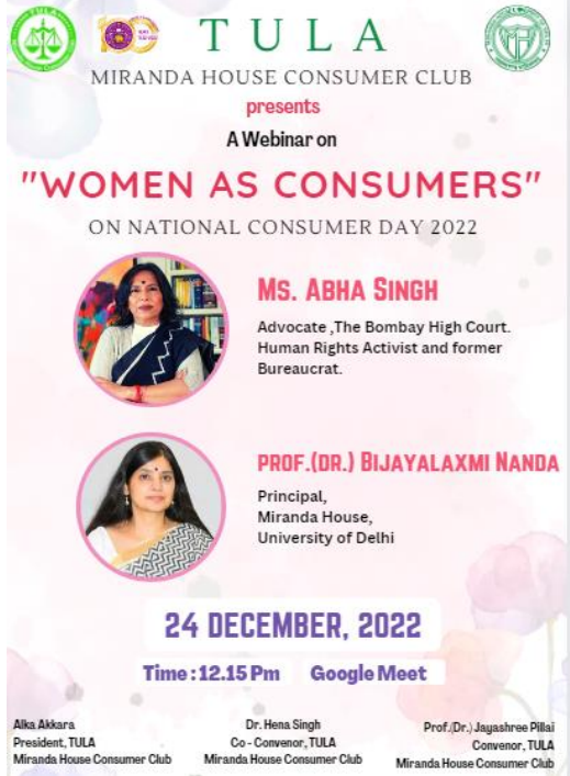
National Consumer Day 2022