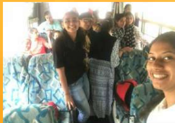
Yunhi kat jaaega safar haste haste