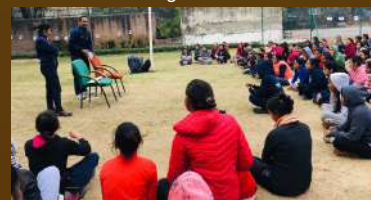
Self Defence Workshop