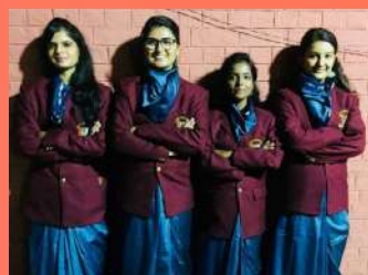
All India Thal Sainik Camp