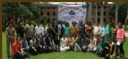
Uri, Jammu-Kashmir students