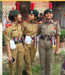
Smartness and beauty is the deadly combination that NCC girls possess. They have proven that it's not the facial glow but hardwork and attitude that shines