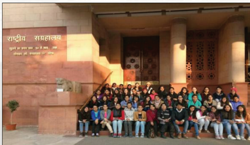
A glimpse into the Heritage: Walking through National Archaeological Park, Mehrauli