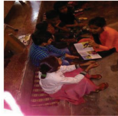
Students with children from Shakurpur Basti at Studio Safdar during Library Sessions